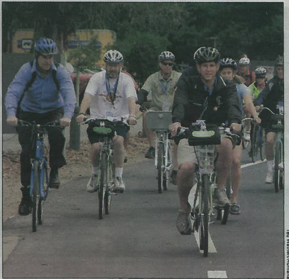
Freewheelin promoted its free bike program with a demonstration ride Monday at the Senior Games. Palo Alto Mayor Peter Dreke is in blue shirt on left.

No cash back or substitutes. One coupon per person only. Nontransferable. Not good with any other offer. Valid at participating locations only. Coupon required for redemption. No duplicates or photocopies will be accepted. Expiration: August 15, 2009